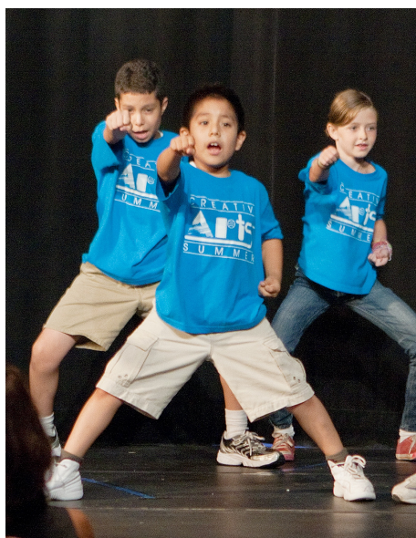
Top: All That Jazz performs Fosse numbers, wowing the crowd. Bottom: Tae Kwon Do puts on a powerful show.